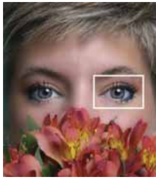
Compare the same image:

Many, small, variable magenta droplets: 20-percent magenta as printed on a four-color variable droplet using only magenta ink