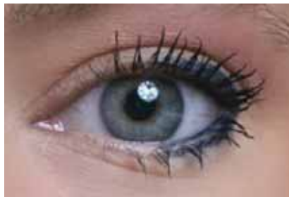
Variable dot printing

be used. When printing high-density areas such as solid colors, you can use large droplets.